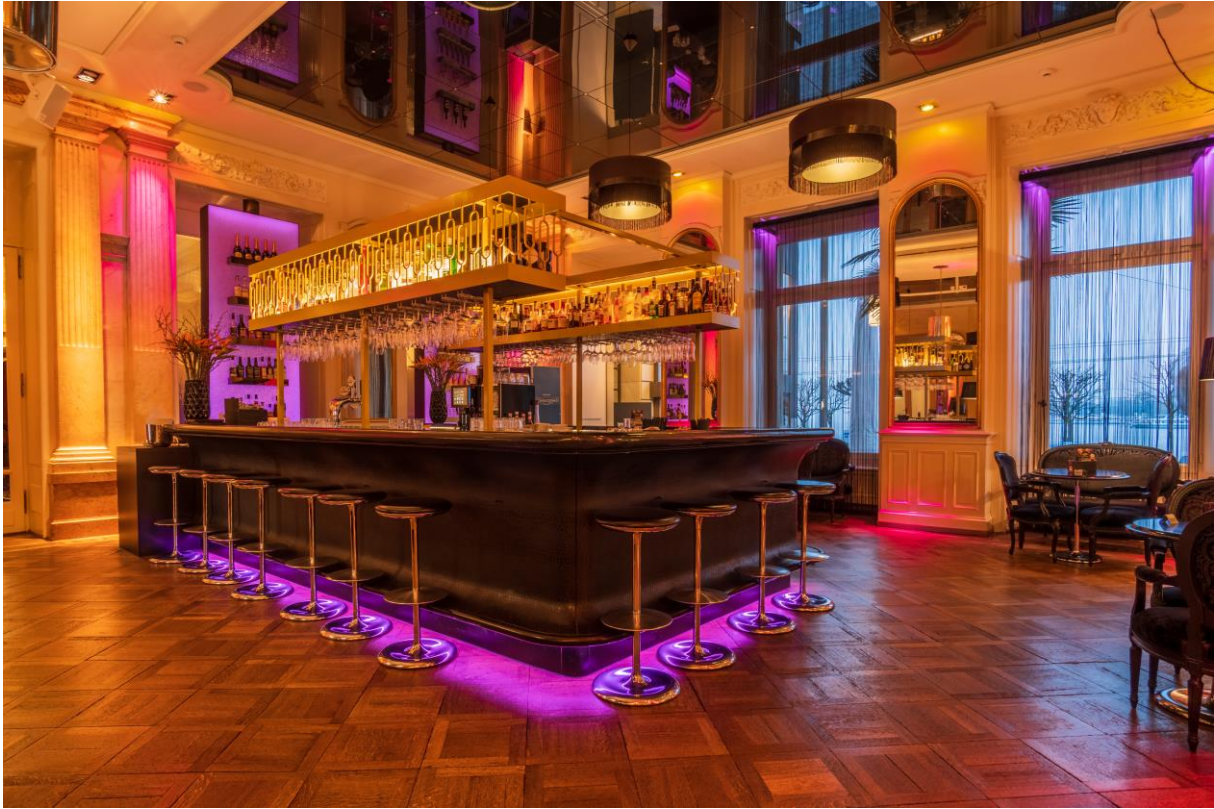
Individual entertainment for in between