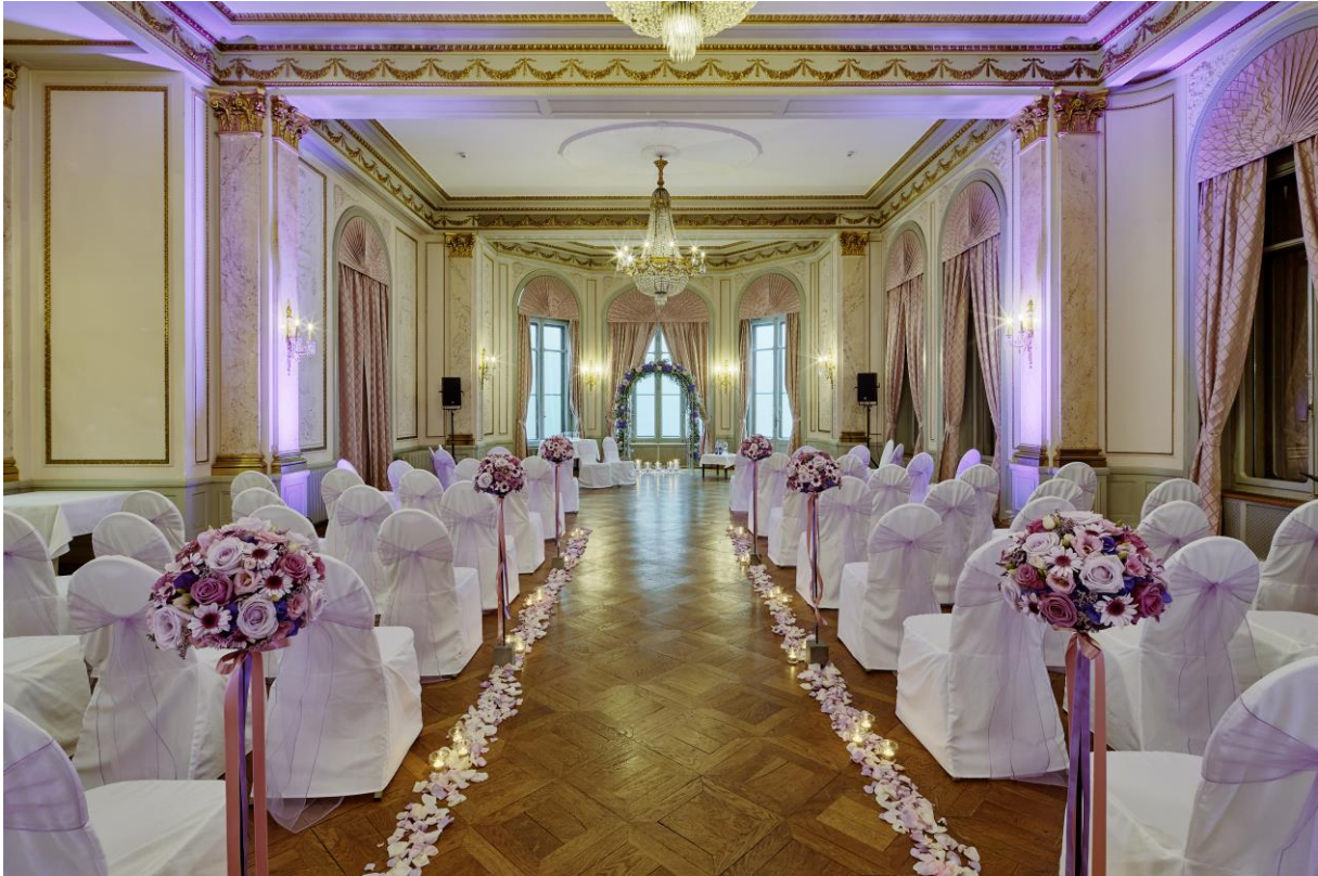
Romantic setting For your wedding ceremony