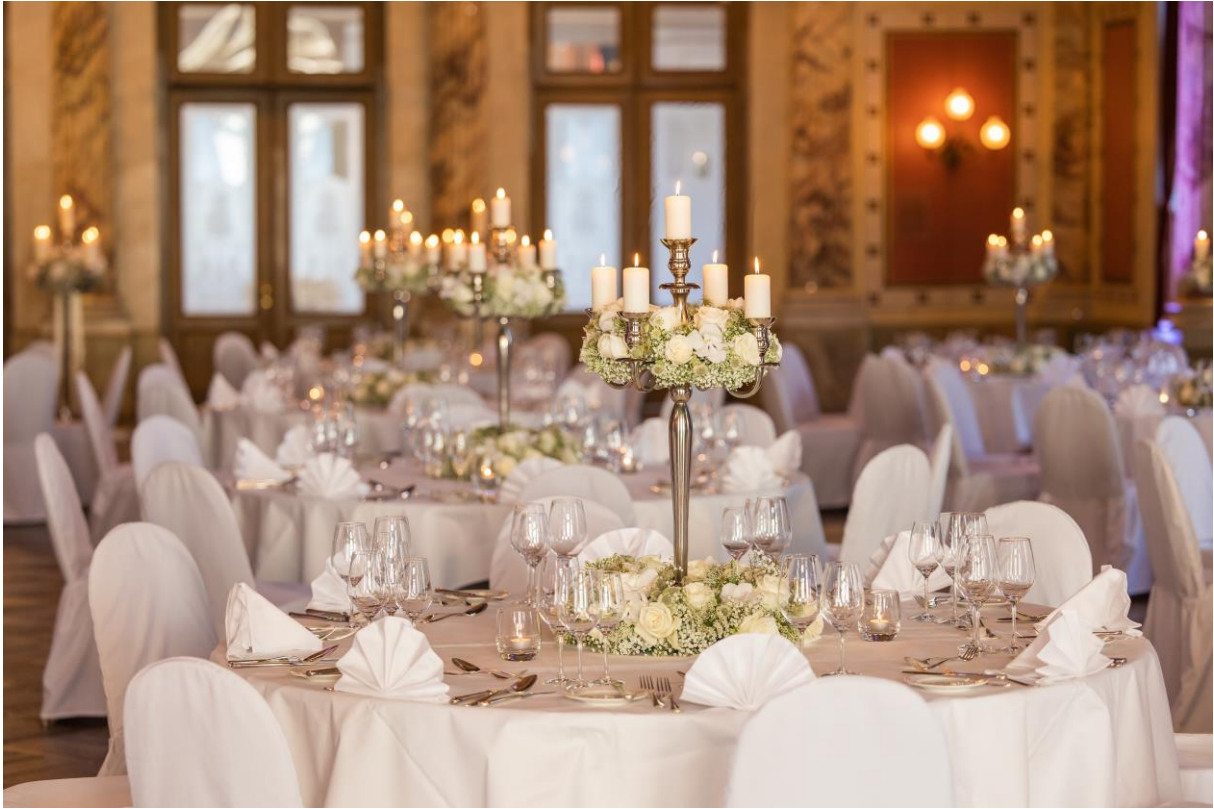
Flower arrangement of our own florist