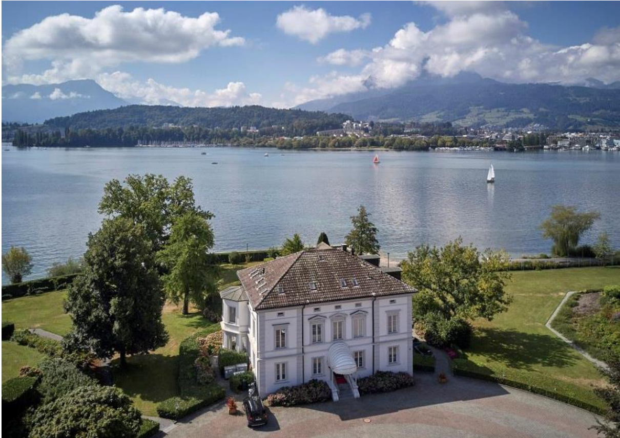
The VILLA Schweizerhof