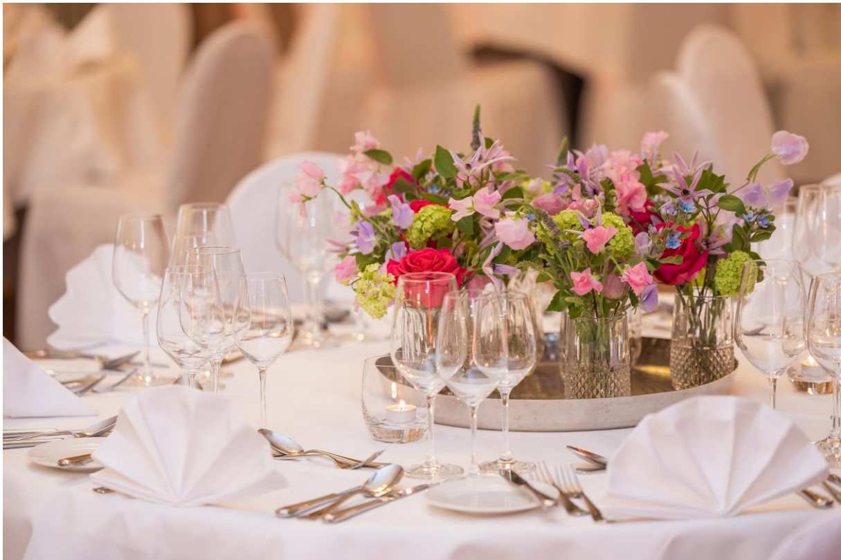
Flower arrangement of our own florist