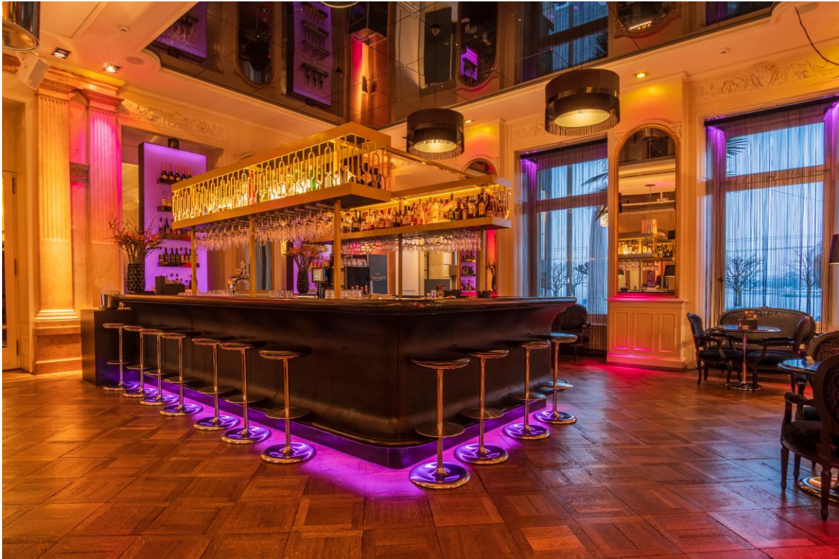
Individual entertainment for in between