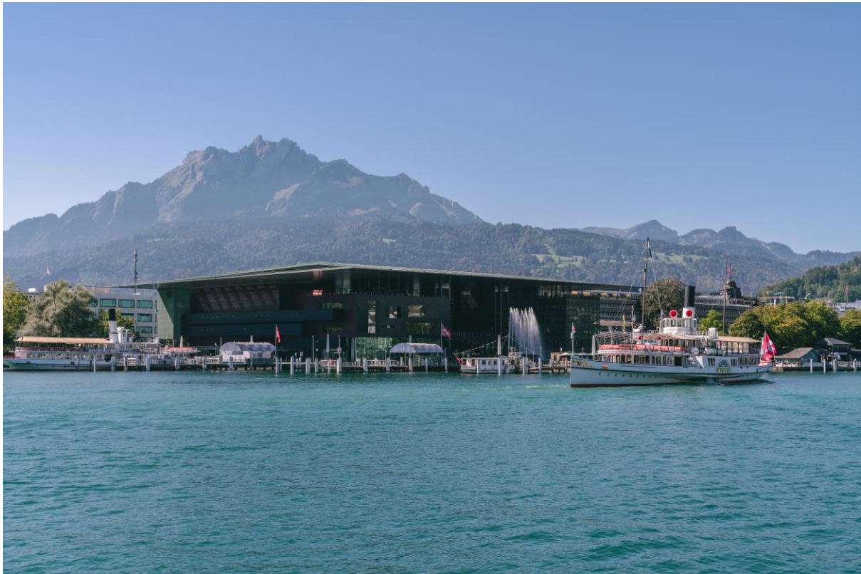
KKL Luzern with Mount Pilatus / Luzern Tourismus | Laila Bosco.