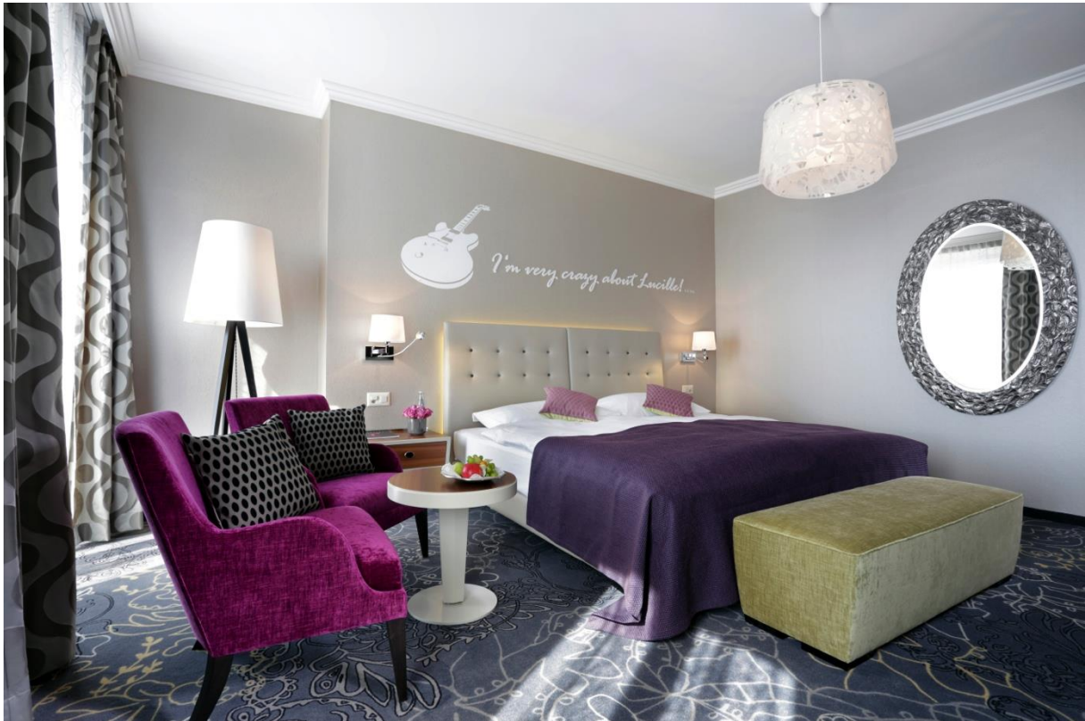
Award-winning Deluxe Double Room