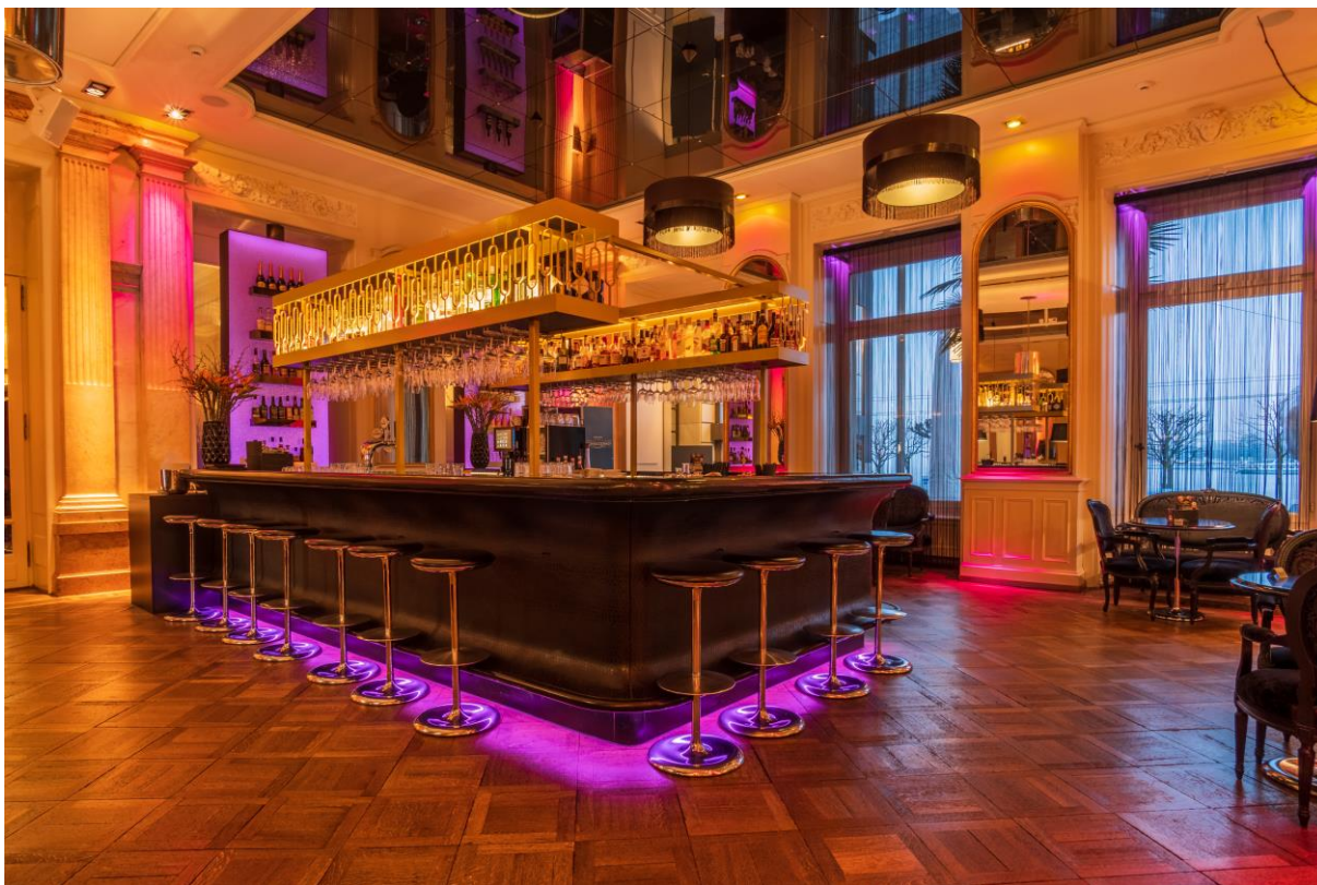
Individual entertainment for in between